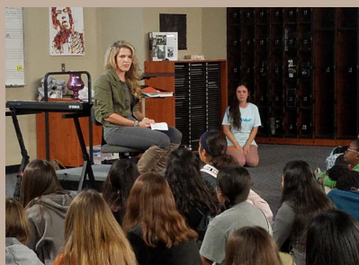
Still Waters, Kaufman $2,000

Find more information at stillwatersps23.com .