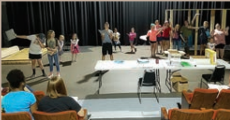
Henderson County Performing Arts Center $4,000

For more information or tickets, visit hcpac.org