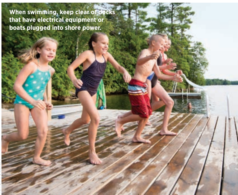
When swimming, keep clear of docks that have electrical equipment or boats plugged into shore power.

If you see someone whom you suspect is being shocked, you should not immediately jump in to save them. Instead, throw them a float, turn off the shore power connection at the meter base, and/or unplug shore power cords. Try to eliminate the source of electricity as quickly as possible, then call for help.