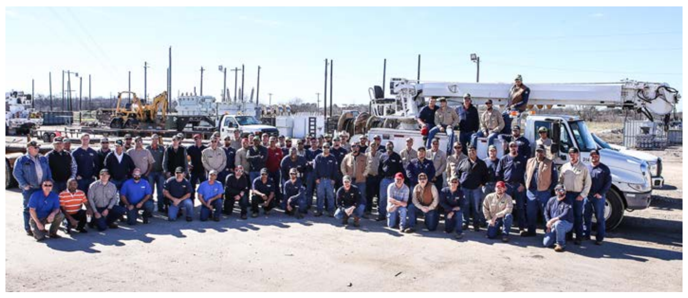
Top: Widespread February storms put TVEC crews to the test. Downed trees, toppled poles and lightning strikes caused outages for more than 3,000 members, but lineworkers had all power restored by the end of the day. Above: TVEC lineworkers pose for a group photo during combined safety training activities February 22 in Kaufman.