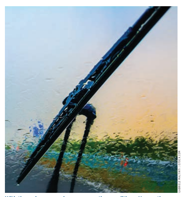
With the spring comes dangerous weather conditions. Use caution on the road when encountering lightning or flash floods.

If you use a generator during a power outage, remember that improper hookup can create serious problems in safety and service. The proper transfer switch is extremely important. Please contact your electric co-op well before an emergency for information on installing and using standby generators.